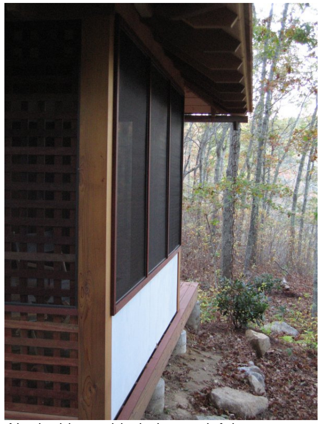
North side – grid window on left has screened top, lucite panel bottom